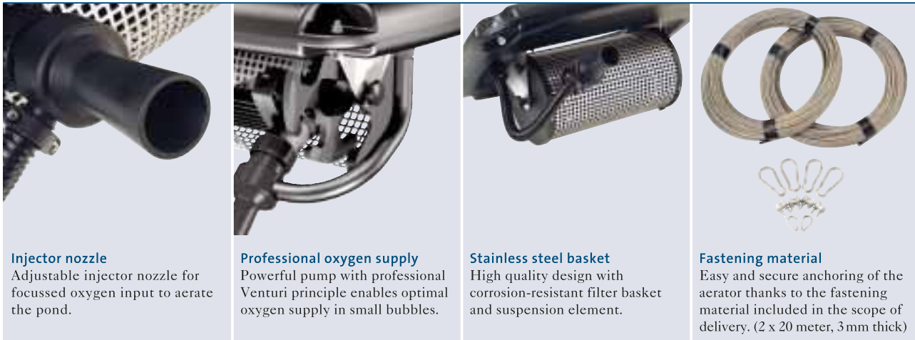
Injector nozzle Adjustable injector nozzle for focussed oxygen input to aerate the pond.